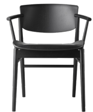
BLACK COLOURED OAK