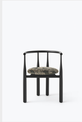
Item No: 41811 Variant: Black w. Upholstery