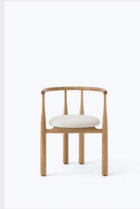
Item No: 41812 Variant: Oak w. Upholstery