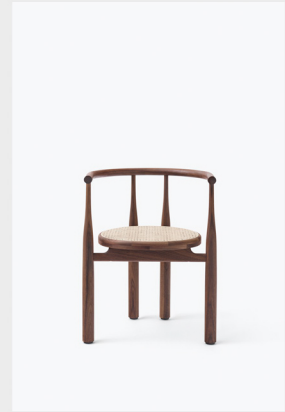
Item No: 41820 Variant: Walnut w. French Cane