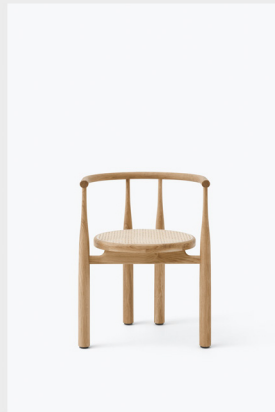
Item No: 41822 Variant: Oak w. French Cane