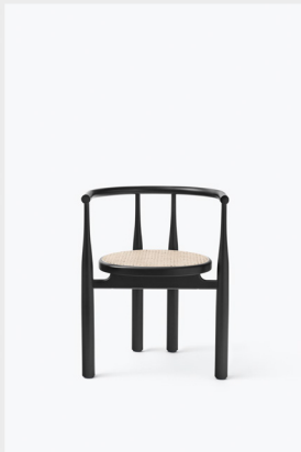
Item No: 41821 Variant: Black w. French Cane