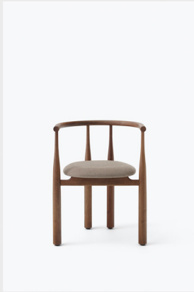
Item No: 41810 Variant: Walnut w. Upholstery